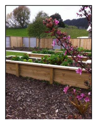
Fruit trees, raised vegetable gardens, a children's playground and a friendly Labrador named Lexi – just a few of the special touches that make Millvale Lodge Lindale unique.