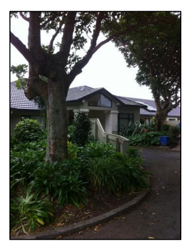
Beautiful established trees frame the new entranceway of Millvale House Waikanae