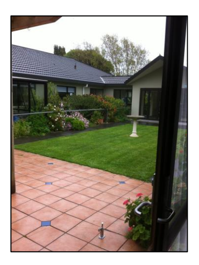
The living area of the new home at Millvale House Waikanae leads out into a sheltered courtyard

A short drive away, Millvale Lodge Lindale is making steady progress as the planned development of this unique rural 'country lodge' continues. The facility now provides all levels of care from rest home to hospital level dementia care, with general hospital/continuing care also available. Residents and families are enjoying the fruit trees and vegetable gardens, and with the arrival of spring daffodils, baby lambs and ducklings abound in the neighbouring fields of the tranquil Lindale valley.